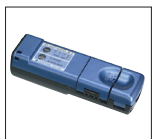
Hot jacket remover JR-6