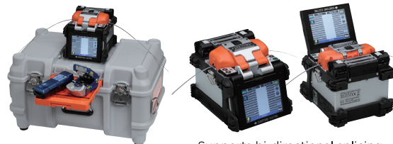
Carrying case with worktable

Items listed in Basic Accessories are always included with the splicer body. Overall kit content may vary regionally. Please check with your local authorised reseller to confirm kit content in your region.