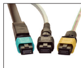
Available for Lynx-Custom Fit™ Splice-On Connector