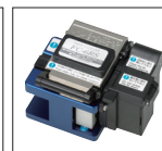
Table-top cleaver FC-6 / FC-6R series