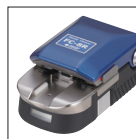
Handy cleaver FC-8R series