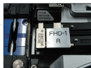
Drop cable splicing with fibre holder system